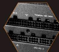
Flexible Modular Cables