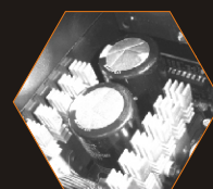
High Quality 105°C E-CAP