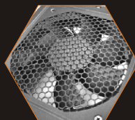
120mm Double Ball Bearing Cooling Fan